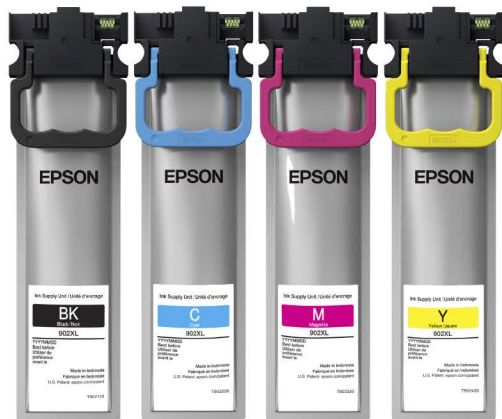
T902 Series Genuine Epson® initial ink packs

Printer designed for use exclusively with Epson ink packs.